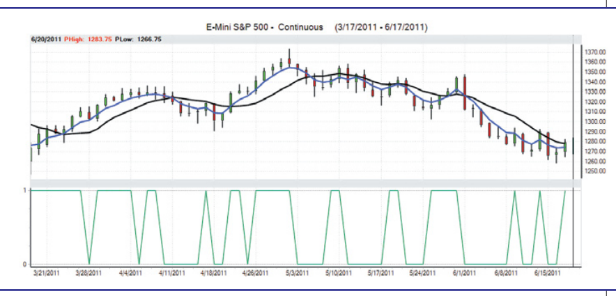
FIGURE 2: THE NEXT DAY

networks to teach them the recent past for thousands of symbols, not just US stocks, but foreign stocks as well. And they also have futures, forex, and exchange traded funds (ETFs) in their list of symbols. You can get a prediction for just about anything you are looking for.